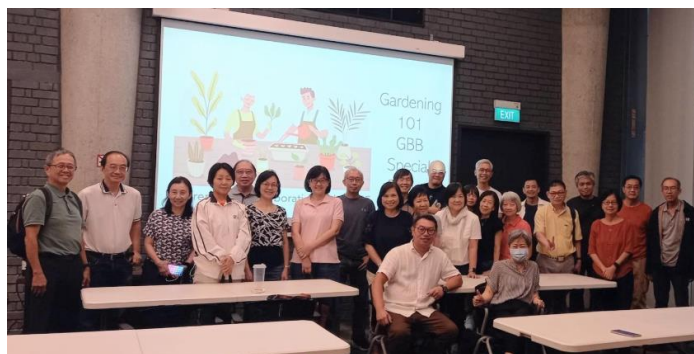
'Gardening 101' @Gardens by the Bay