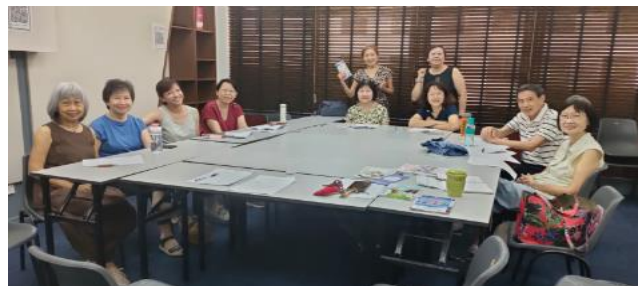
'Beautiful Goodbys' class @Peninsula Plaza