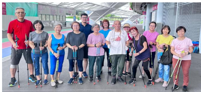
'Nordic Walking Clinic' @Sports Hub