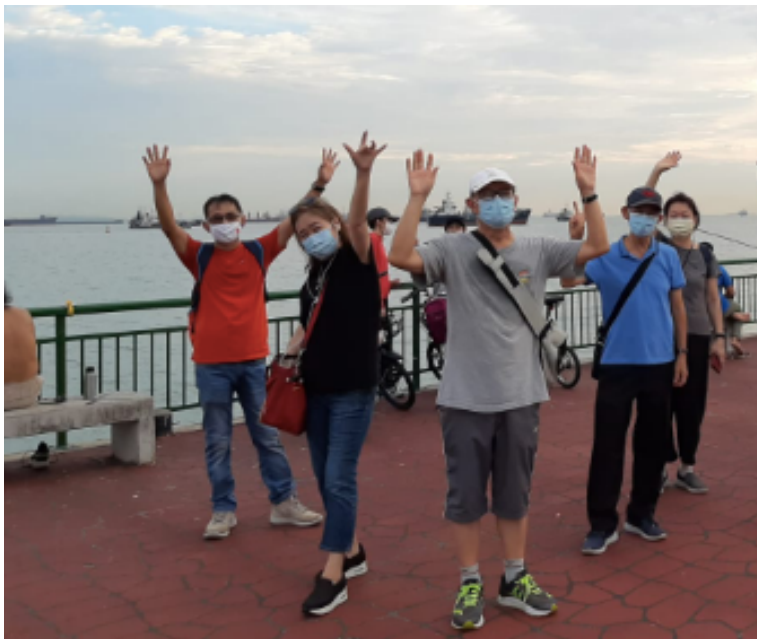
Rambled in East Coast Park on 18 October.