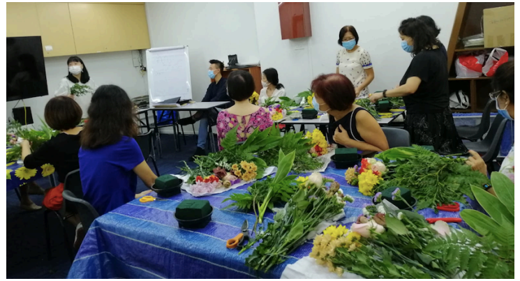
Free Style Floral Arrangement