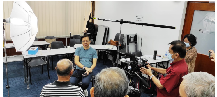
The Art of Documentary Film and Video Production - class practice on conducting interview